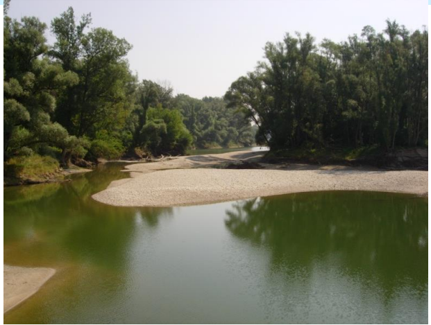
Figure 1: Partially reconnected sidearm of the Danube.

Hydro-morphological restoration of riverfloodplain systems is important basin-wide to conserve biodiversity (EU Biodiversity Strategy to 2020, EU Habitats and Birds Directive, HBD) and